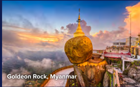
Goldeon Rock, Myanmar