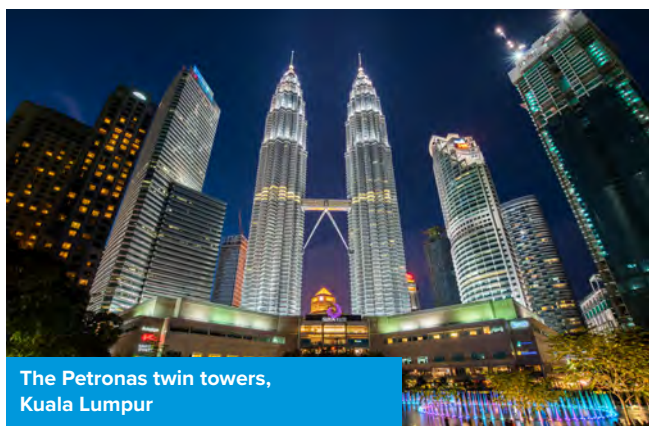
The Petronas twin towers, Kuala Lumpur