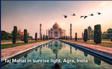
Taj Mahal in sunrise light, Agra, India