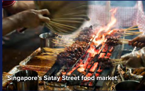
Singapore's Satay Street food market