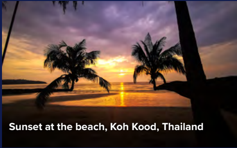
Sunset at the beach, Koh Kood, Thailand