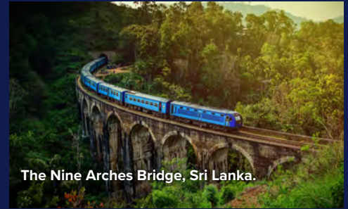
The Nine Arches Bridge, Sri Lanka.