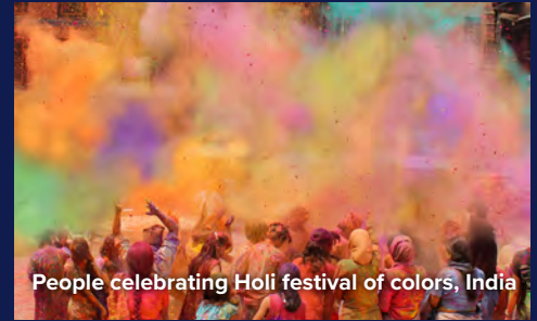
People celebrating Holi festival of colors, India