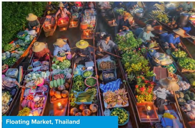
Floating Market, Thailand

In winter, the climate is generally tropical with temperatures around 30 degrees Celsius and this is regarded as the cool, dry season with less rainfall.