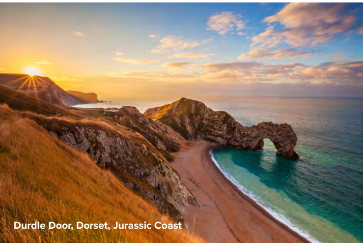
Durdle Door, Dorset, Jurassic Coast