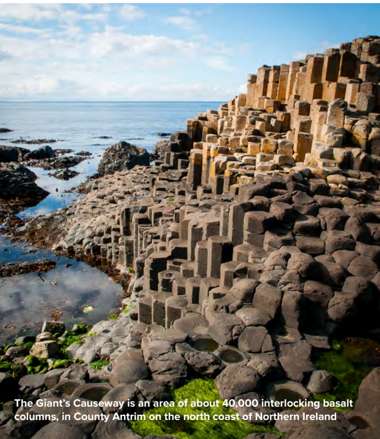
The Giant's Causeway is an area of about 40,000 interlocking basalt columns, in County Antrim on the north coast of Northern Ireland

The peak months of June, July and August are generally more reliable for settled sunny weather and warmer temperatures, though conditions can be changeable. Cruises in the English Channel tend to run for a longer season than those in the North Sea or Irish Sea, helped by the Christmas market season that kicks off in December.