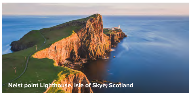
Neist point Lighthouse, Isle of Skye, Scotland

Pick a theme – bring out the best of British on voyages that focus on gastronomy, horticulture and glorious gardens, while wildlife cruises, photography sailings and walking-themed itineraries showcase another side of the UK.