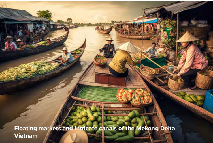
Floating markets and intricate canals of the Mekong Delta Vietnam