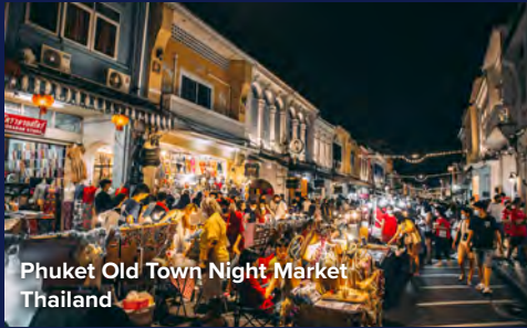
Phuket Old Town Night Market Thailand