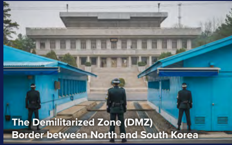
The Demilitarized Zone (DMZ) Border between North and South Korea