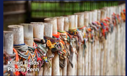
Killing Fields Phnom Penh