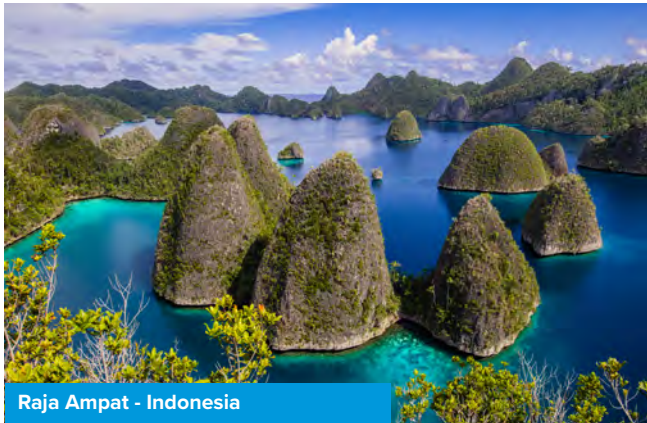
Raja Ampat - Indonesia

The winter is regarded as the cool, dry season with less rainfall, though conditions are generally tropical with temperatures around 30 degrees Celsius.