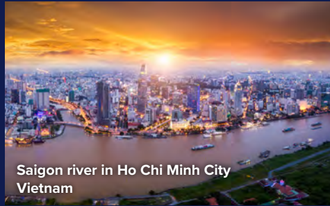
Saigon river in Ho Chi Minh City Vietnam