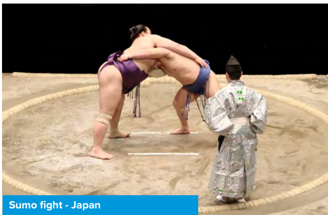
Sumo fight - Japan