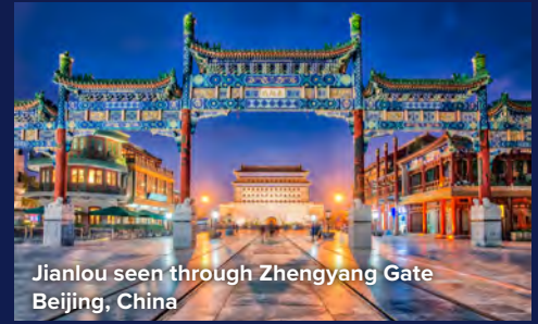
Jianlou seen through Zhengyang Gate Beijing, China