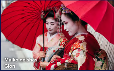
Maiko geishas Gion