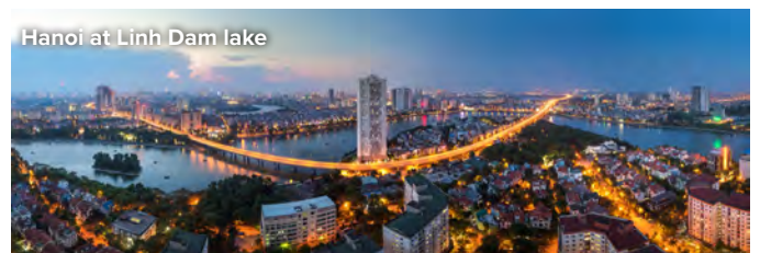
Hanoi at Linh Dam lake