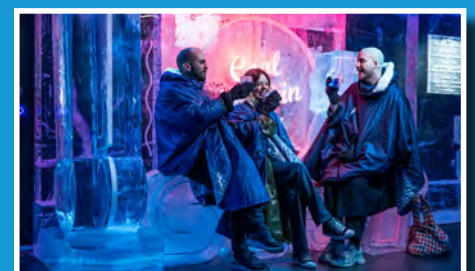
Say cheers in the Ice Bar in Hotel C by Stockholm's Central Station.