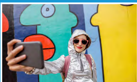
Take a selfie with the last remaining bit of wall in Berlin.