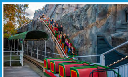
Smile for the camera as you ride the wooden coaster in Tivoli Gardens.