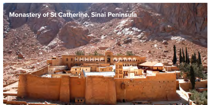
Monastery of St Catherine, Sinai Peninsula

Two-centres – cruises from Dubai and Abu Dhabi lend themselves to add-ons, along with stays at Sharm el Sheikh or Aqaba on the Red Sea or Jordan's capital Amman.