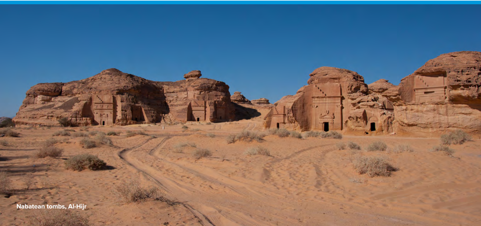
Nabatean tombs, Al-Hijr