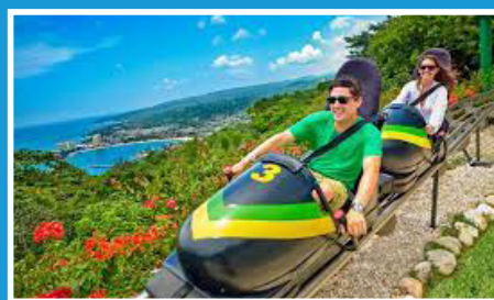
Smile for the camera as you race down Mystic Mountain in a bob-sleigh.