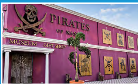
Pose in the stocks in the Pirates of Nassau experience