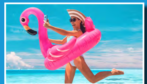
Capture the moment with sun, sand and sea, and you in the middle.